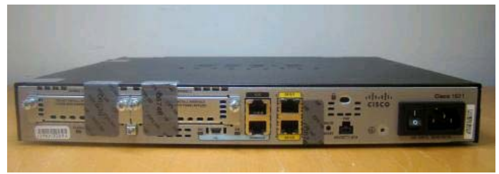
Figure 8: Cisco 1921 ISR Back