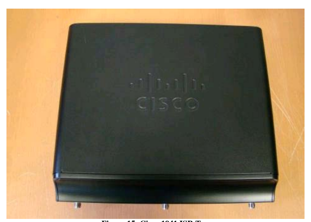
Figure 15: Cisco 1941 ISR Top