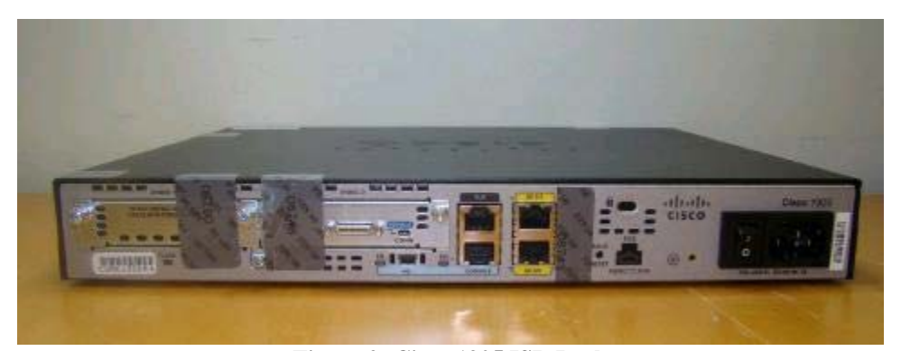
Figure 2: Cisco 1905 ISR Back