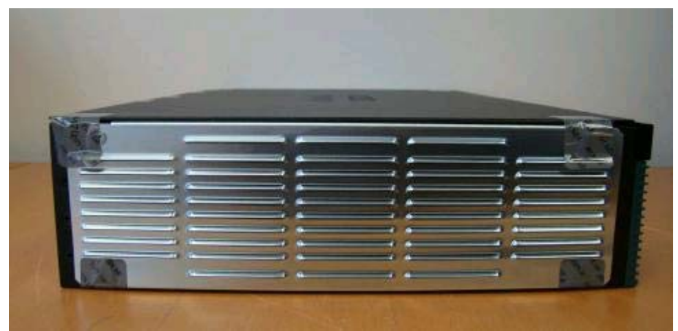
Figure 30: Cisco 2911 ISR Left Side