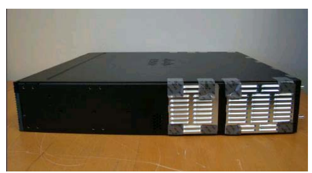
Figure 35: Cisco 2921 ISR Right Side