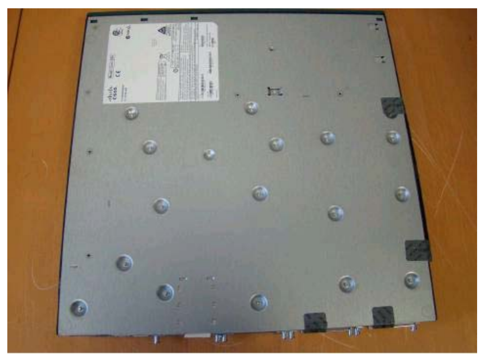
Figure 22: Cisco 2901 ISR Bottom