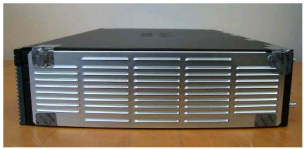
Figure 29: Cisco 2911 ISR Right Side