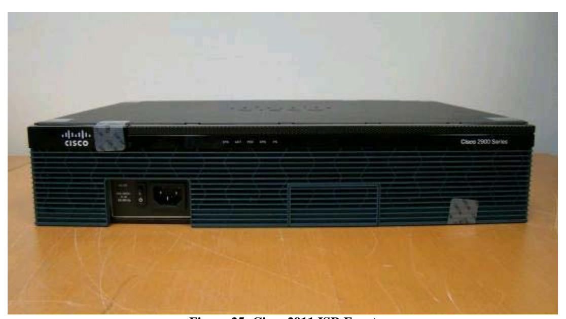
Figure 25: Cisco 2911 ISR Front