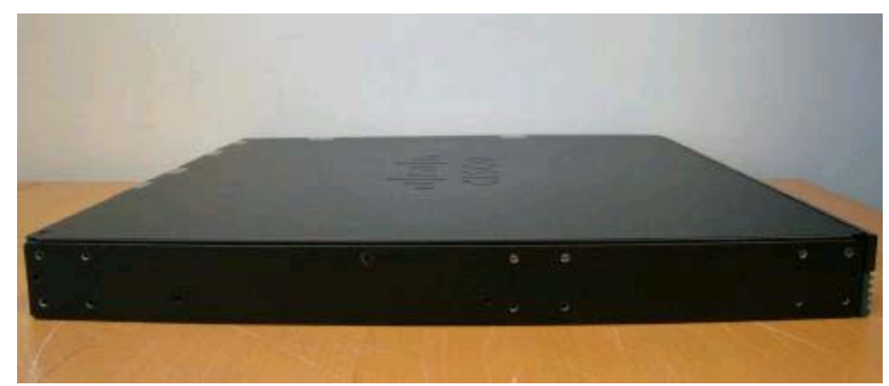
Figure 24: Cisco 2901 ISR Left Side