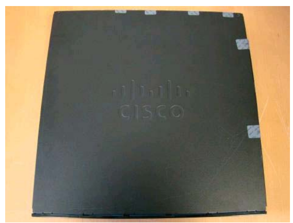
Figure 21: Cisco 2901 ISR Top