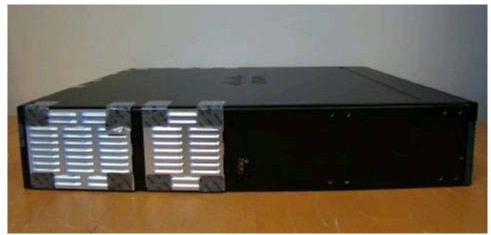
Figure 36: Cisco 2921 ISR Left Side