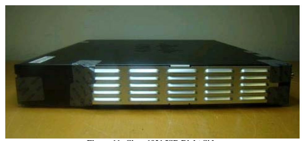
Figure 11: Cisco 1921 ISR Right Side