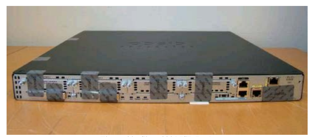
Figure 20: Cisco 2901 ISR Back