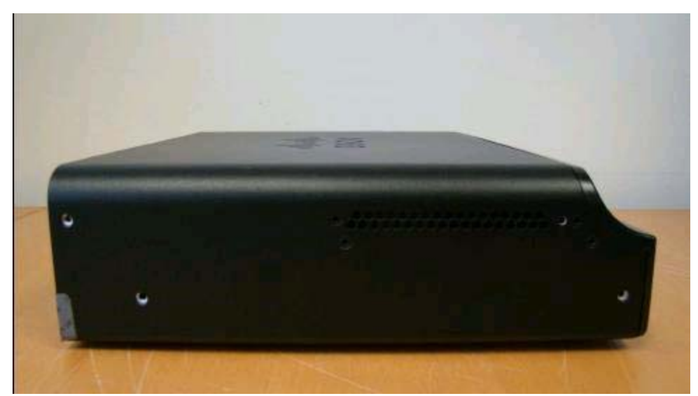
Figure 18: Cisco 1941 ISR Left Side