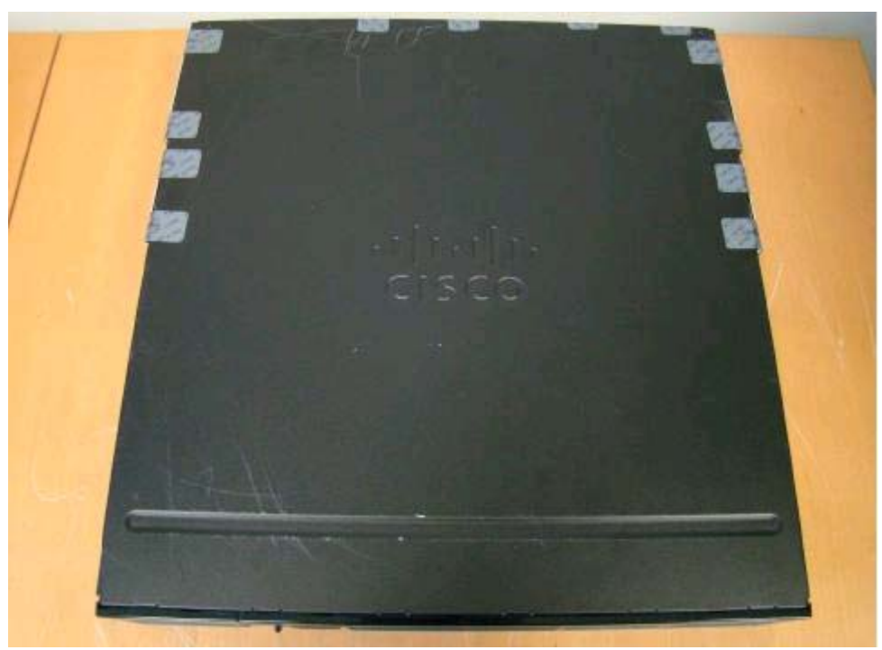
Figure 33: Cisco 2921 ISR Top