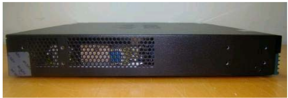
Figure 6: Cisco 1905 ISR Left Side