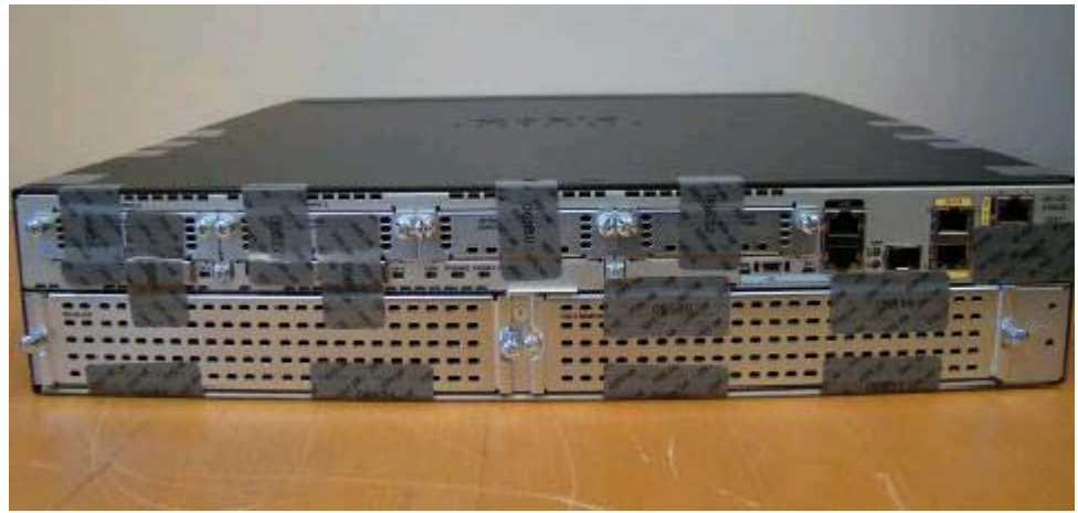
Figure 32: Cisco 2921 ISR Back