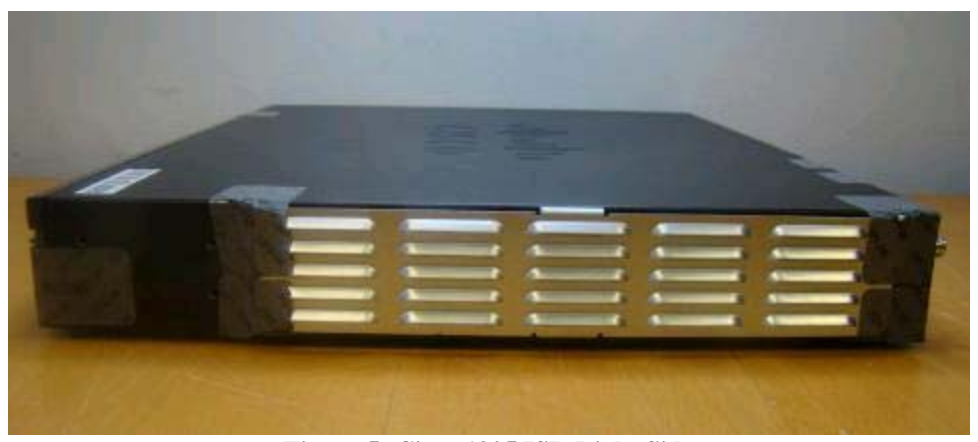
Figure 5: Cisco 1905 ISR Right Side