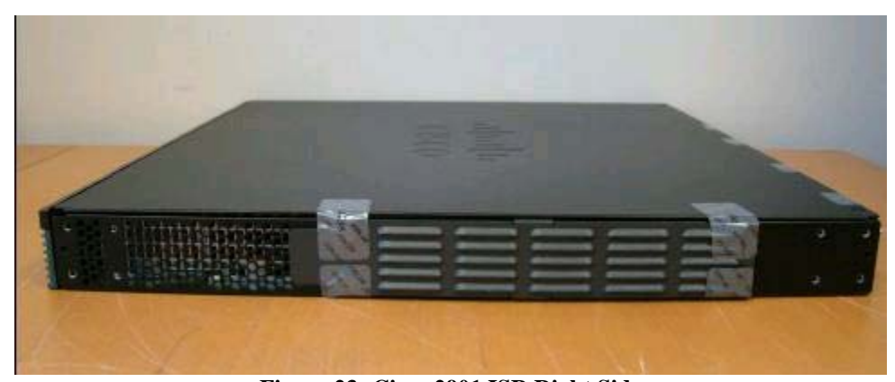
Figure 23: Cisco 2901 ISR Right Side