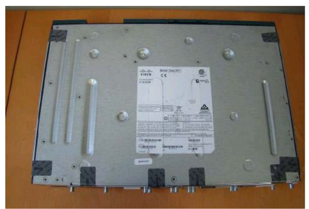
Figure 28: Cisco 2911 ISR Bottom