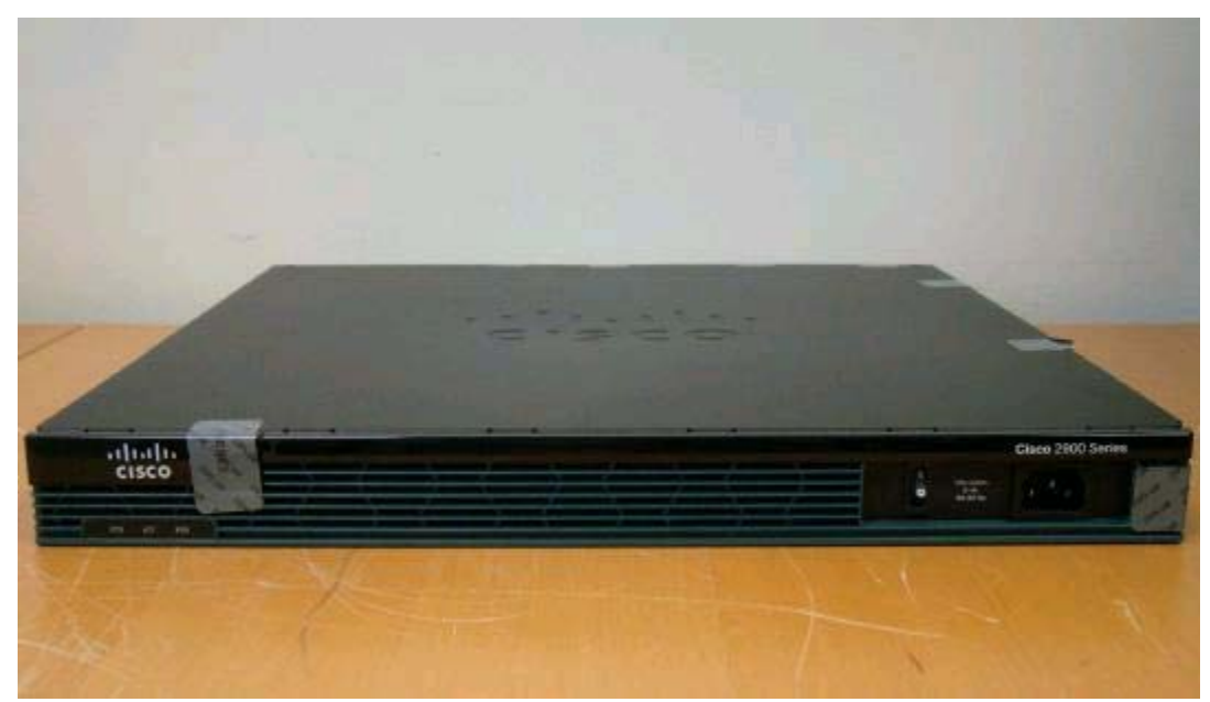
Figure 19: Cisco 2901 ISR Front