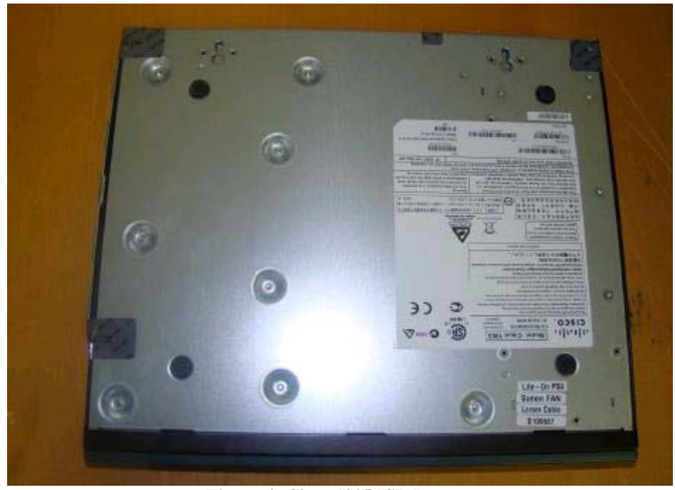
Figure 4: Cisco 1905 ISR Bottom