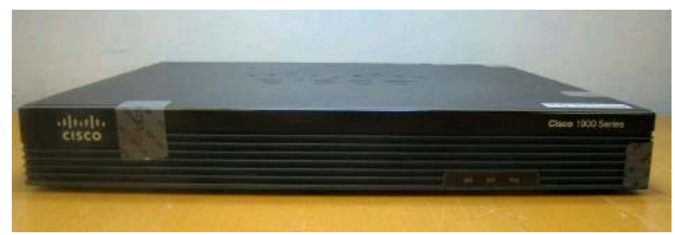
Figure 1: Cisco 1905 ISR Front

Install the opacity plates and apply serialized tamper-evidence labels as specified in the pictures below: