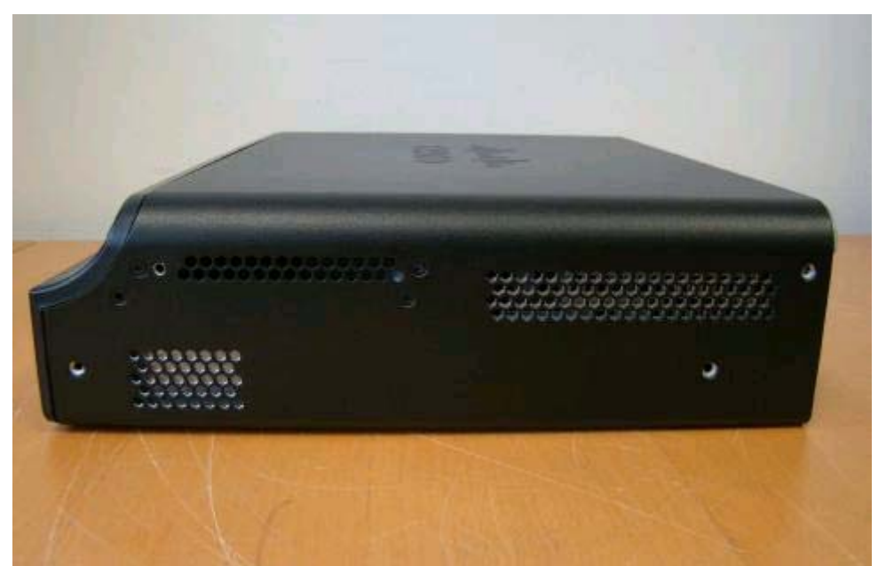
Figure 17: Cisco 1941 ISR Right Side