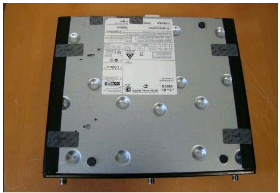
Figure 16: Cisco 1941 ISR Bottom