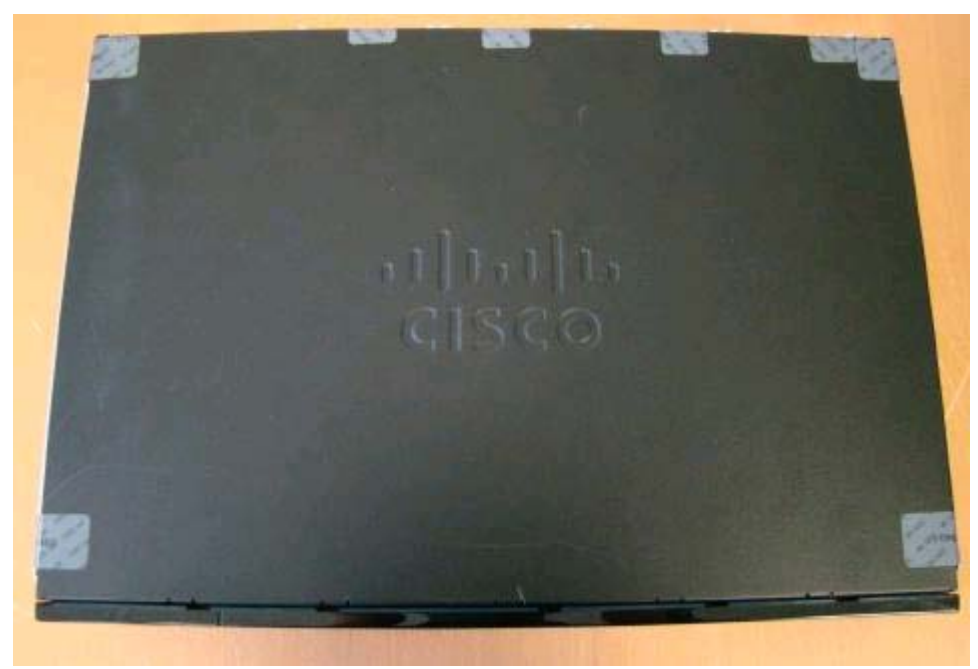
Figure 27: Cisco 2911 ISR Top