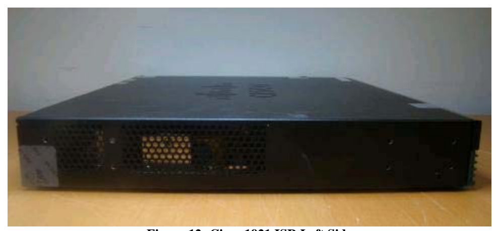
Figure 12: Cisco 1921 ISR Left Side