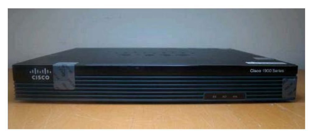
Figure 7: Cisco 1921 ISR Front