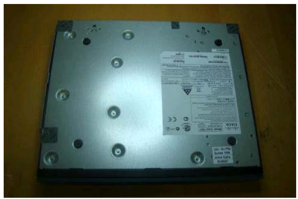
Figure 10: Cisco 1921 ISR Bottom