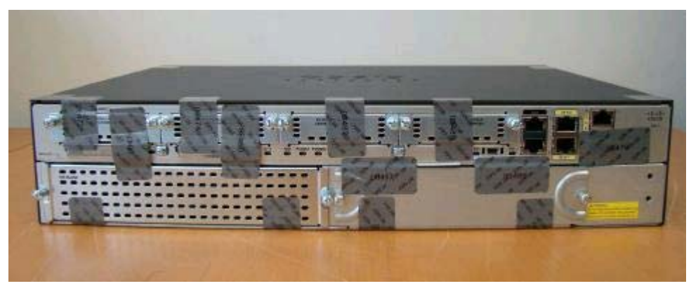
Figure 26: Cisco 2911 ISR Back