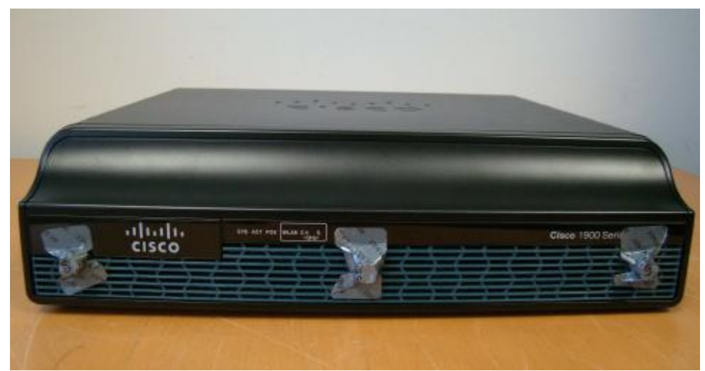
Figure 13: Cisco 1941 ISR Front