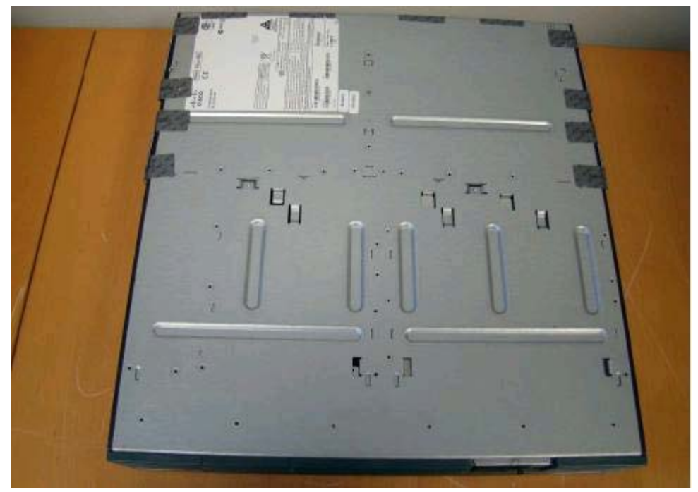
Figure 34: Cisco 2921 ISR Bottom