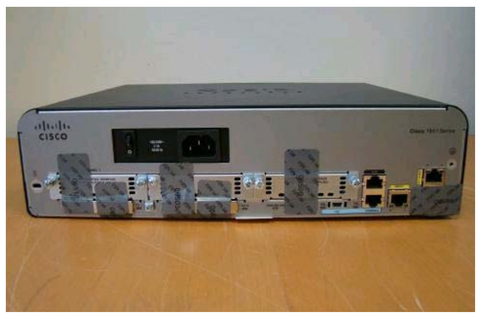
Figure 14: Cisco 1941 ISR Back